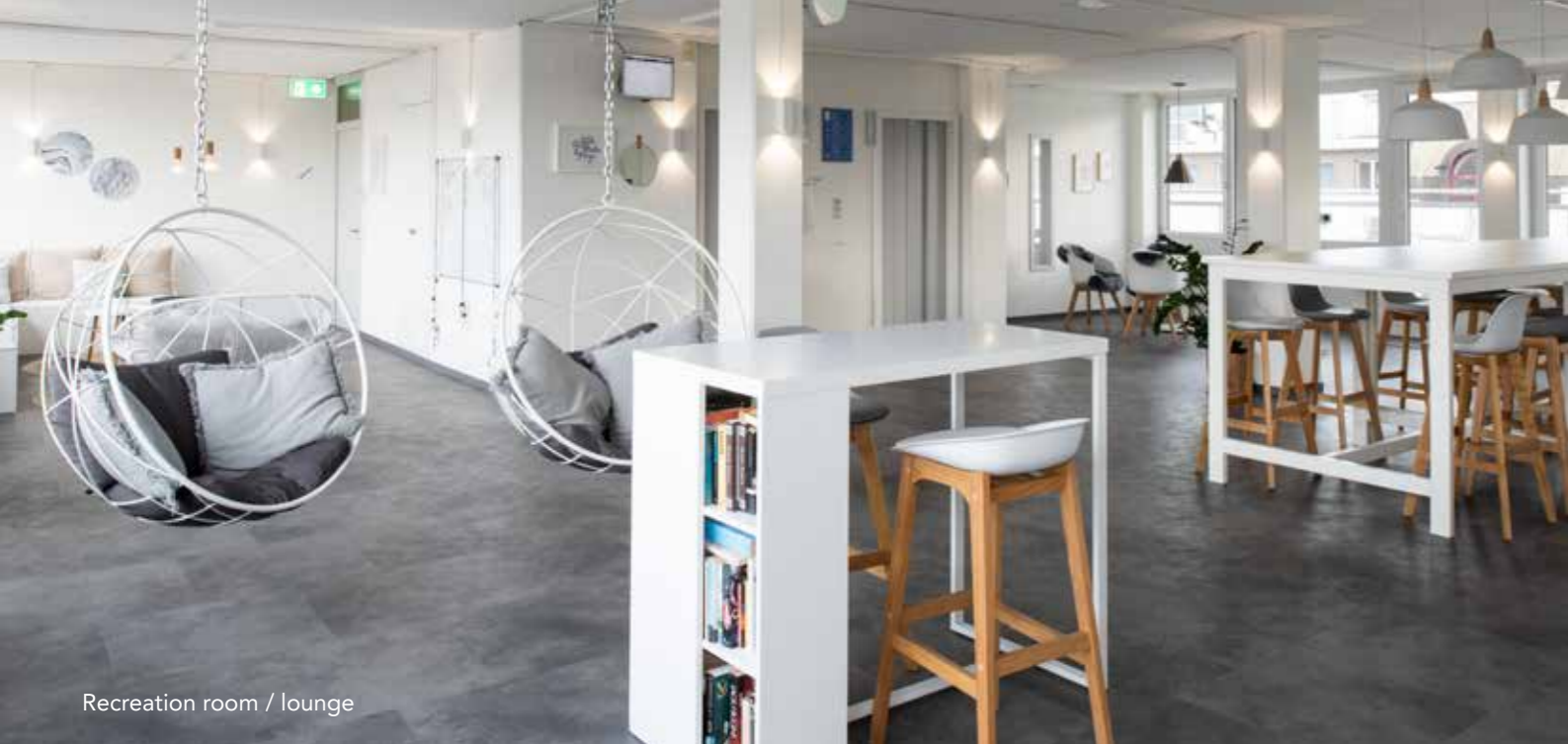
Recreation room / lounge